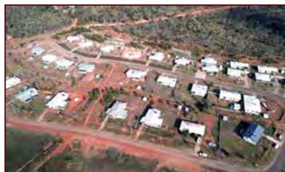
BELOW: Lockhart River Subdivisions: the first in 2014 (above) cost $3.2m for 29 lots (average of $119k per block) and the second in 2023 (below) cost $7.2m for 25 lots (average $340K per block).