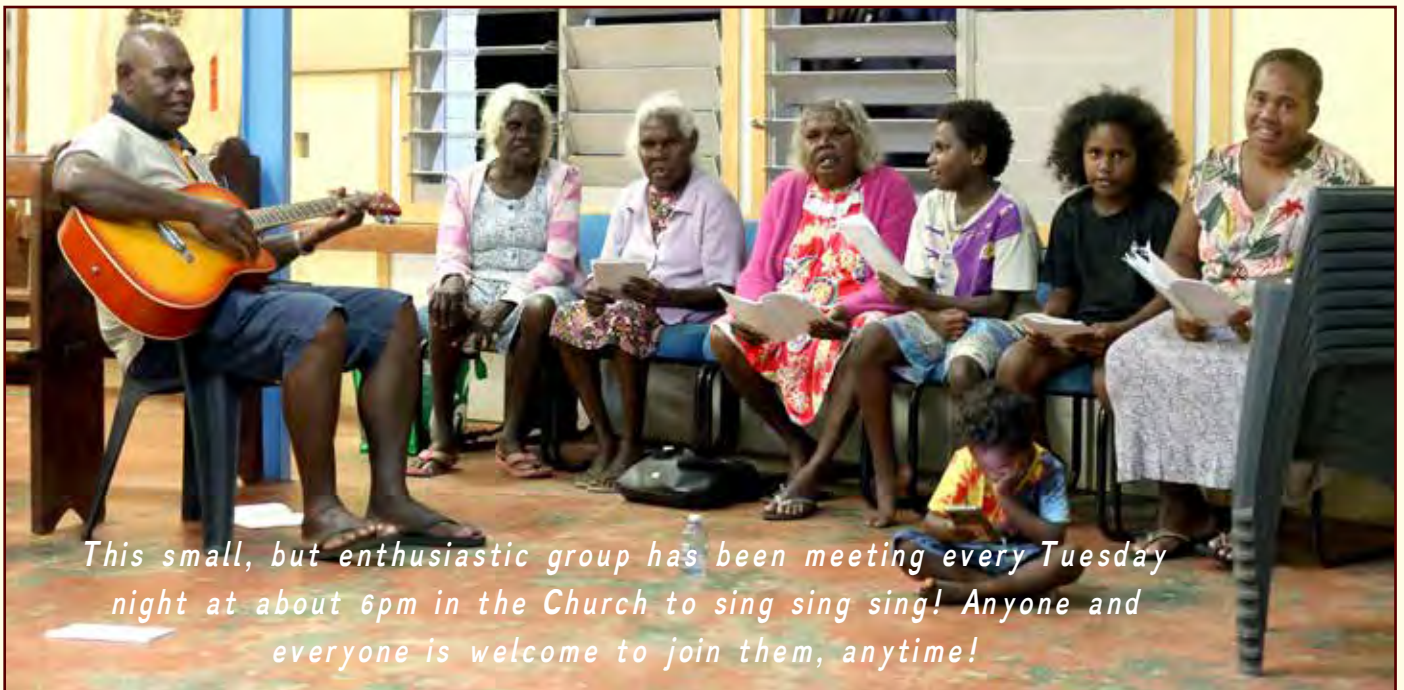
This small, but enthusiastic group has been meeting every Tuesday night at about 6pm in the Church to sing sing sing! Anyone and everyone is welcome to join them, anytime!