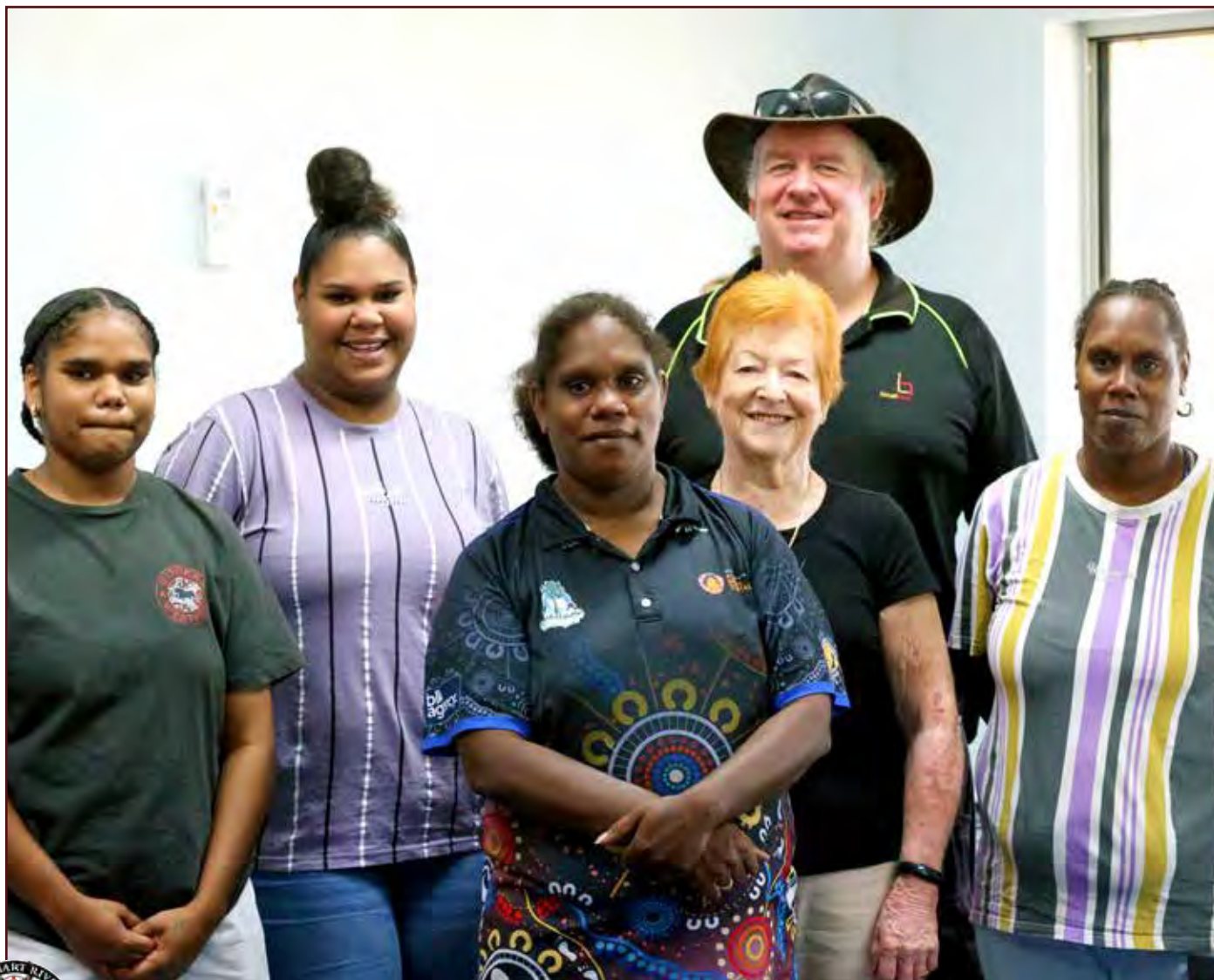
Council staff in the Lockhart River office