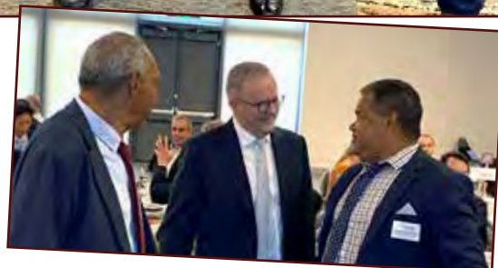
TOP: Palm Island Mayor Alf Lacey, Prime Minister Anthony Albanese and Mayor Wayne Butcher in Brisbane.