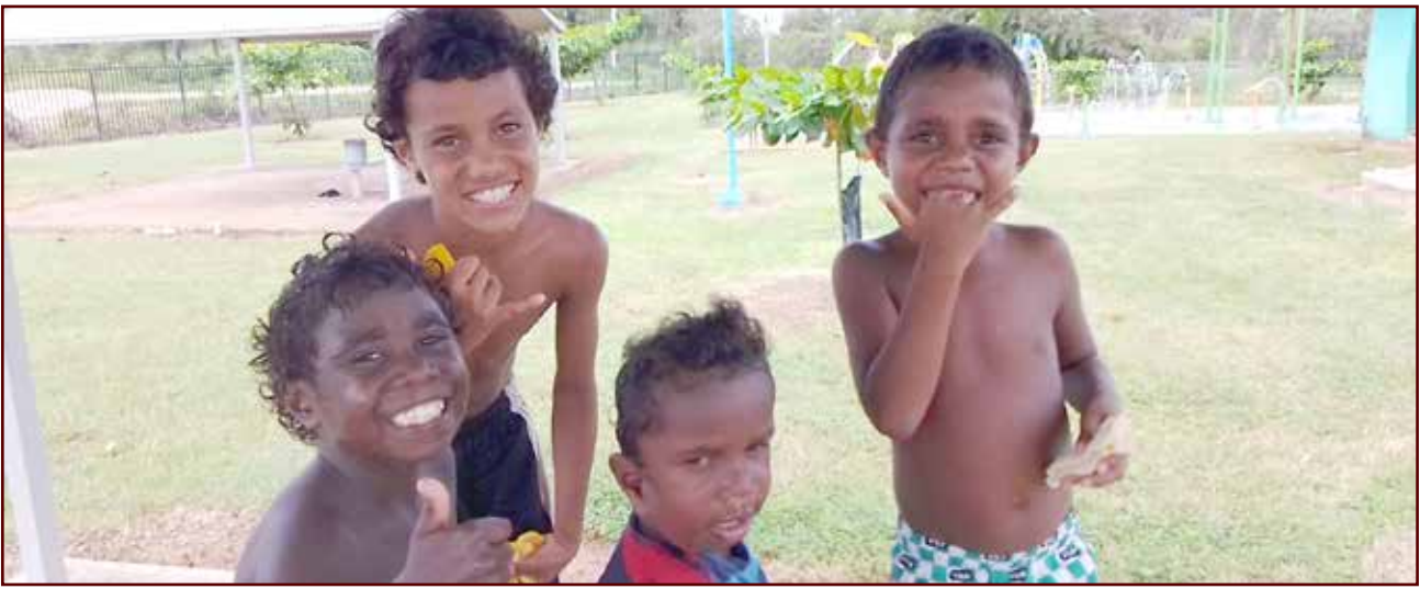
A Kid's Club visit to the Water Park is always popular!