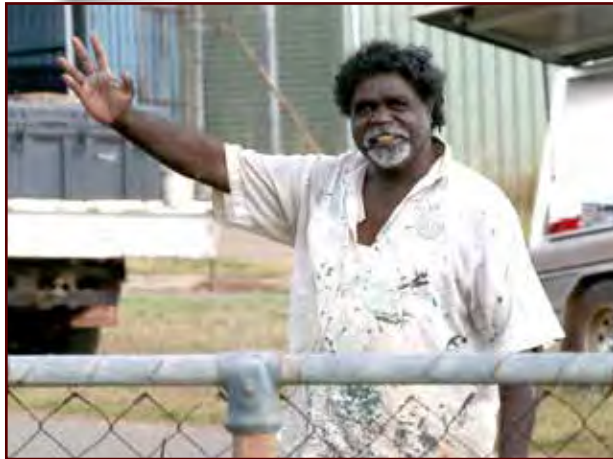
Carpenters, labourers, electricians and the store staff (page 22) along with contractors (above) painters (left and right), locals (bottom left and plumbers work with Building Services to improve our community.