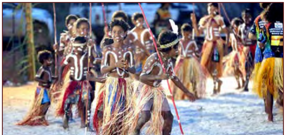
Kawadji Wimpa dancers at last year's Paytham Malkari Festival. For details about this year's event see pages 12-13.