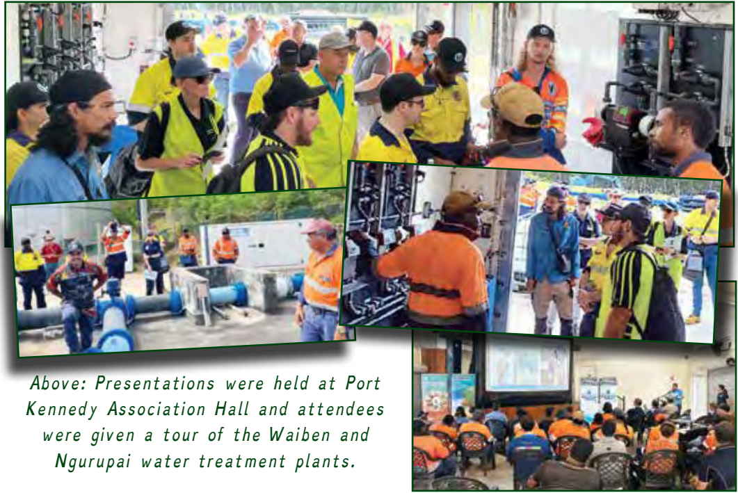
Above: Presentations were held at Port Kennedy Association Hall and attendees were given a tour of the Waiben and Ngurupai water treatment plants.

Representatives from water operators from Indigenous communities across Queensland gathered on Thursday Island for the 2024 Queensland Indigenous Council Drinking Water Symposium earlier this year.